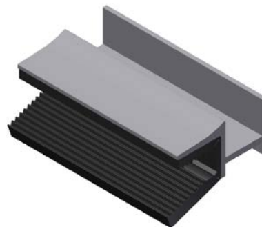
Figure 2: Jurchen MK-A II HR End Clip